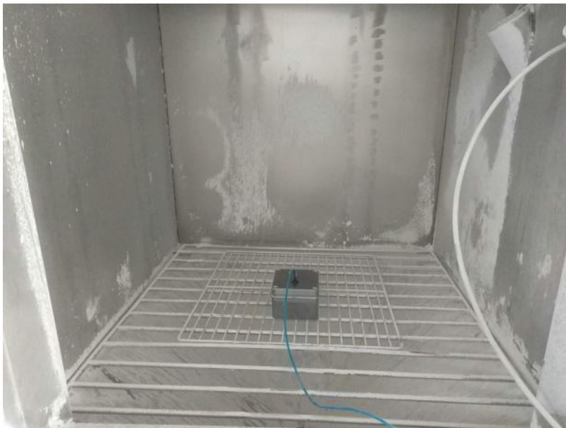
Test Set-up Photo