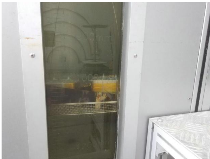
Test Set-up Photo